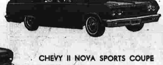
CHEVY II NOVA SPORTS COUPE